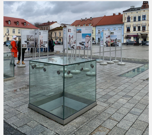
The city of Oświęcim today