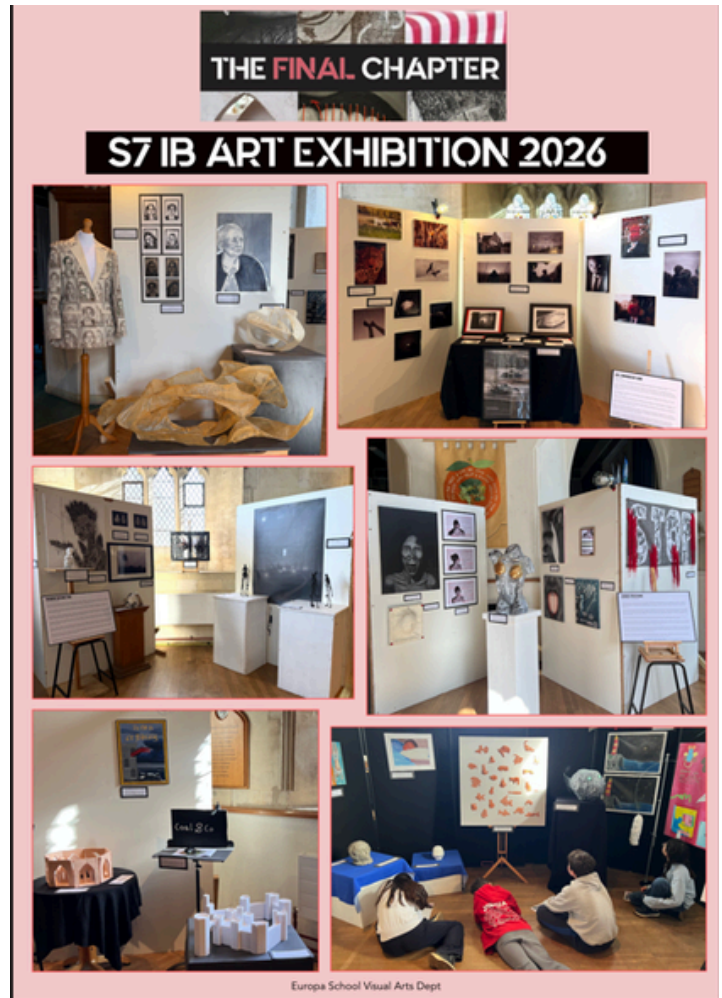
Europa School Visual Arts Dept.