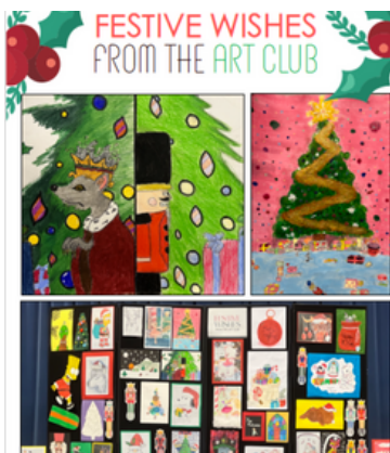
Acrylic on paper