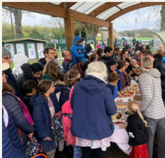
The Easter bake sale raised £1,258! All funds will support future DIY projects at the school. View the full photo album