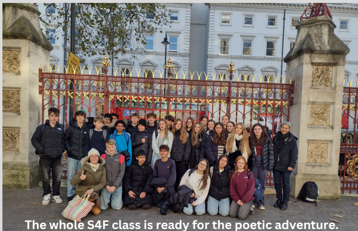
The whole S4F class is ready for the poetic adventure.

On 22 November, we (S4f) went to the Poetry Slam Convention in South Kensington.