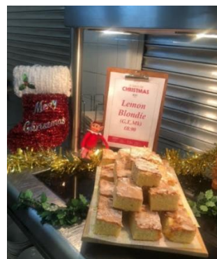
Morning break in the canteen