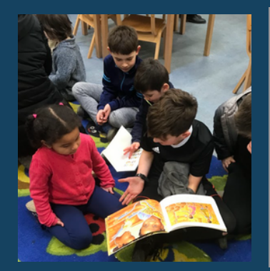
Our Multilingual book week has been a feast of reading activities. Across the primary school, children have shared, discovered and discussed books from around the world. Staff introduced their favourite books during World book day assemblies and as always the dressing up was fabulous. Thank you everyone for making the