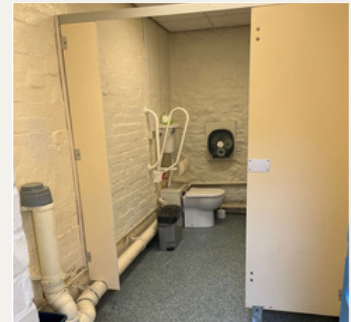
The toilets behind Kiddylinguistics are also getting a glow-up.