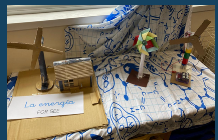
5EE offshore energy/ Energia aeólica

More information will follow with the details of what happens next, when and where.