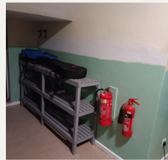
Music block - replastered wall (work in progress)