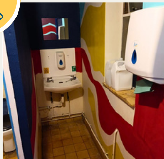
"Contractors" toilet near the primary quad, now AKA the "funky" toilet

More repairs were tackled during our last DIY evening on 8 May. The "contractors toilet" is getting funkier by the day and crumbling plaster in the music block hallway has had a glow up. If you want to suggest a repair, please use our form.