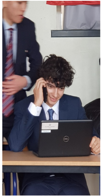
Time for lobbying