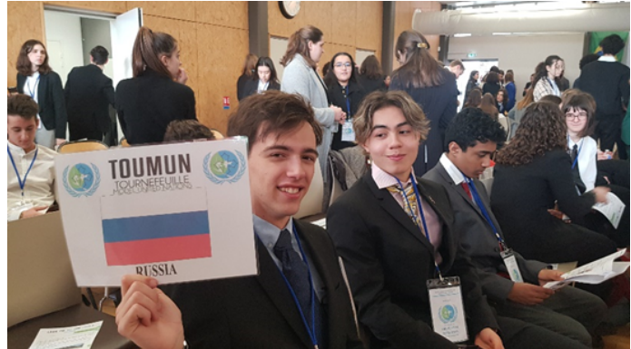
Ambassador of Russia : Speech