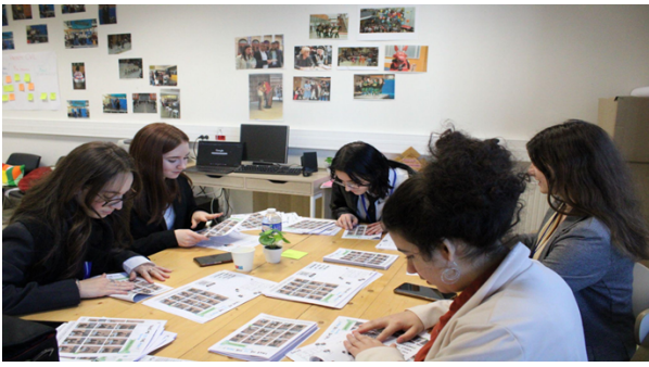
Media time in action