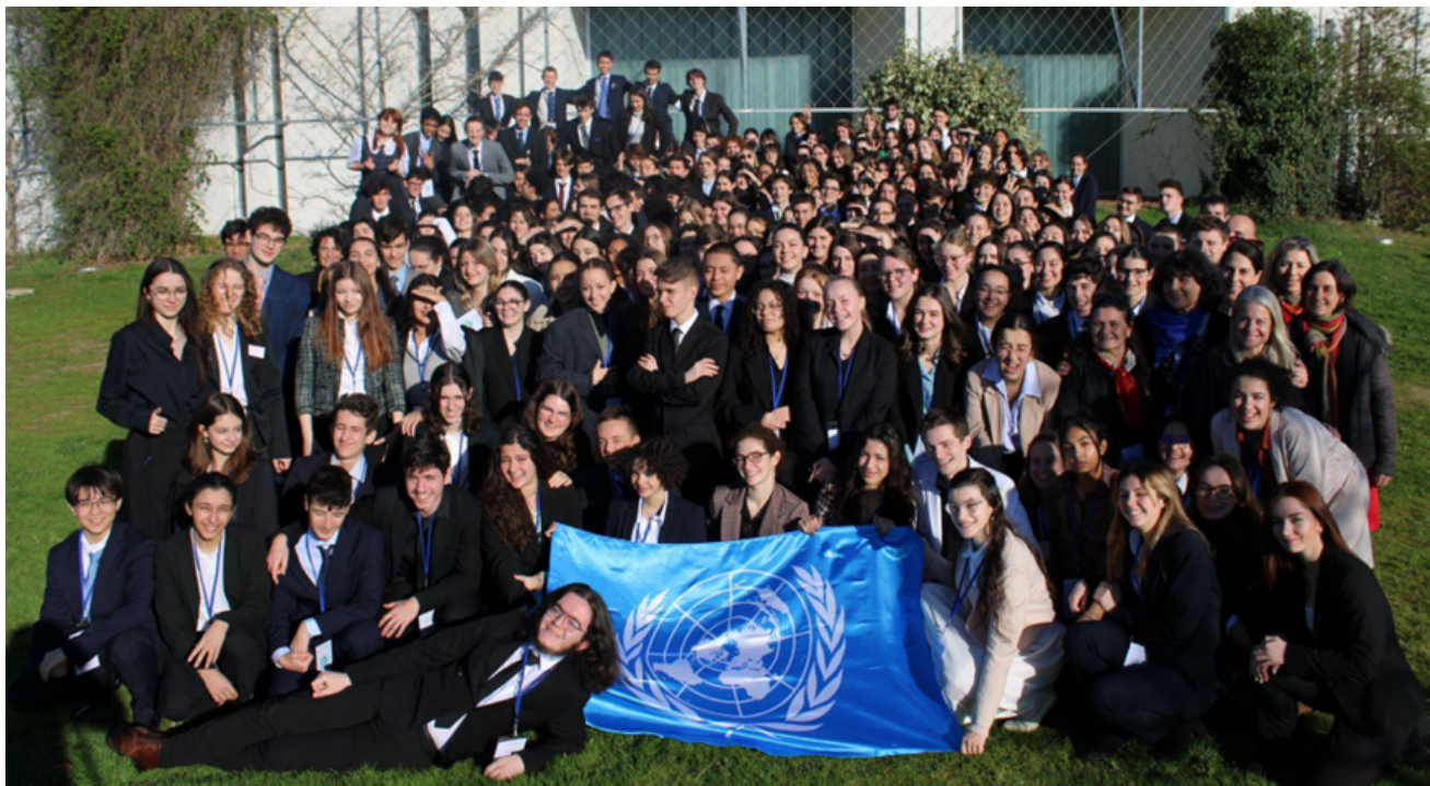
PARTICIPANTS TOUMUN 2023

https://drive.google.com/file/d/17e0QcefW9T7VmumdnypuNTz6pqXorNQD/view?usp=sharing