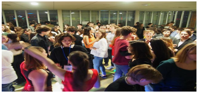
Social event :Party