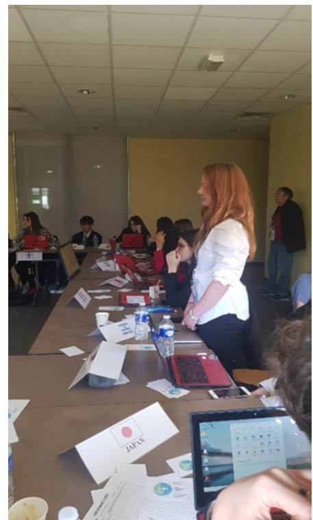
Present and defend your resolution