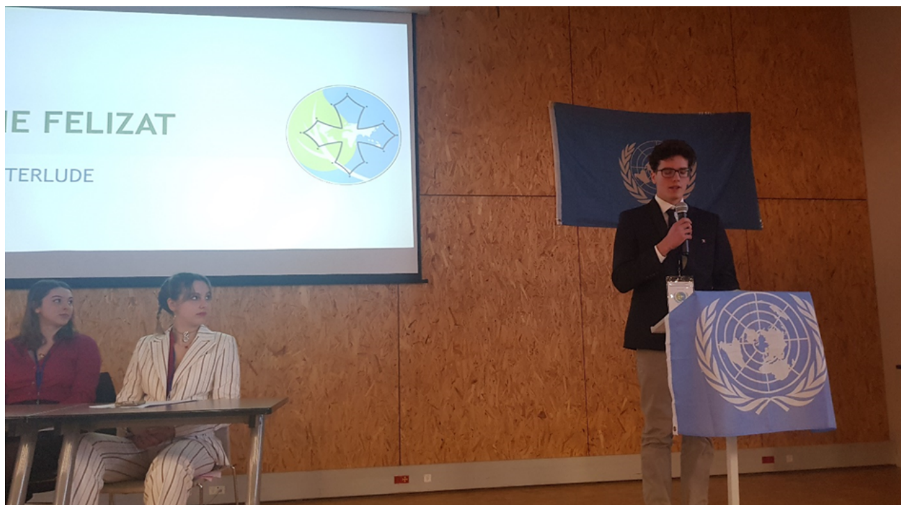
Ambassador of Italy : Speech :