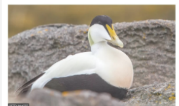
Five gannets among the species of ground-nesting birds at South Walney Nature Reserve.

Grey waders, black-gulls and drongos are disturbing nesting birds at a nature reserve, conservationists have warned.